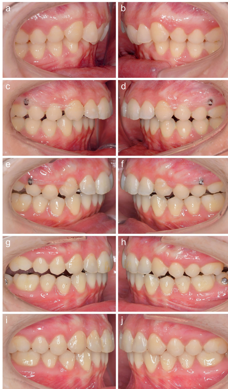
Fig. 4 The initial class II malocclusion ( a,b , T0) is worsening to more than half a unit during levelling and aligning ( c,d ). At the beginning of en masse distalization (T1), the lower curve of spee is levelled and the inclination of the upper incisors has improved ( c,d ). The buccal MSs are inserted with a 30 degree angle compared to the adjacent teeth. A few months later, the overjet is reduced and now the buccal screws have to be removed ( e,f ). Further bite correction achieved with the help of the palatal screws only, which now are removed (T2). Note the intrusion in the upper lateral segments ( g,h ). Final result (T3) after maxillary en masse distalization with upper torque control ( i,j ). A bilateral class I canine relationship and a normal overjet could be achieved

during retraction results in intrusion in the lateral segments, which leads to compression for the dental arch when lingual appliances are used. The maxillary posterior intrusion as such has a favourable effect on mandibular repositioning, as it prevents largely an unwanted clockwise rotation of the mandibular jaw.