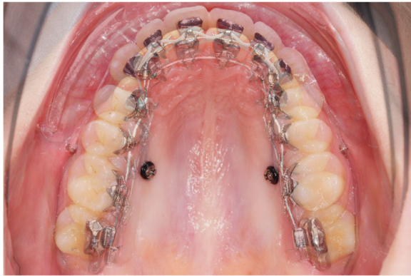
Fig. 5 Superposition of the maxillary dentition at T1 and T2 on the palatal MSs (for illustrative purposes only, not used for measurements). The distance between the two archwires in the anterior segment is indicating the amount of maxillary en masse distalization

cephalogram of, respectively, a mean 2.8 mm and 2.0 mm for a distalization using buccally inserted interradi- cular MSs in combination with labial appliances [26, 56]. Utilising a comparable method, Bechthold et al. described distalization with a mean up to 2.9 mm [24]. Longer average lengths of distalization of maxillary molars, even more than 6 mm in the area of the dental crown, have been described in cases of insertion of the MSs in the anterior palate, though some studies have found considerable distal tipping of the upper first molars [57]. Using a rigid superstructure, Nienkämper et al. reported average distalization in the area of the centre of resistance of the upper first molar of 3.6 \pm 1.9 mm (min/ max 1.2–8.5 mm) [40]. Thanks to the control achieved, distal tipping of the upper first molars could be limited to 1.5 deg. on average in this case [40, 58]. However, studies on distalization appliances anchored to the palate can be compared to this paper only to a very limited extent, since the analyses performed for them mostly focus on molar distalization in the maxilla only. Essential treatment tasks, including mandibular levelling and maxillary retraction from 5 to 5 ensuring anterior torque control, remain to be done at that point and in part pose a considerable challenge in terms of quality of posterior anchorage [31–36, 39–43].