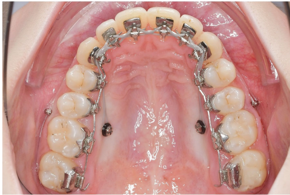
Fig. 1 Completely customized lingual appliance (CCLA) combined with a novel mini-screw anchorage concept for maxillary en masse distalization. The 0.016" x 0.024" stainless steel archwire has an extra-torque of 13° from canine to canine and 2 cm expansion in the region of the first molars