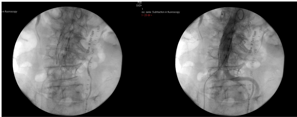
Figure 1 Placement of a single tube which completely excluded the AAA.

Endologix ® grafts were used mostly (40 cases, 75.4%), besides Vanguard ® grafts (7 cases), Talent ® , Parodi ® and Baxter Lifepath ® (2 cases each). In 28 cases (52.8%) a single aortic straight tube was used (Group A), while in the remaining cases a “double trombone technique” was used, as described previously (Group B).