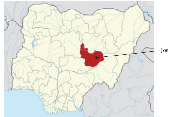
FIGURE 1: Map of Nigeria showing Plateau State (in red) and the City of Jos. https://upload.wikimedia.org/wikipedia/commons/thumb/6/66/Nigeria_Plateau_State_map.png/250px-Nigeria_Plateau_State_map.png .

The HIV treatment program at JUTH is a major public resource for HIV services in the area, providing comprehensive HIV treatment and care for the city of Jos and serving as a referral center for Plateau and neighboring states. The Decentralization Initiative's "hub-and-spoke" model of care aimed to replicate the JUTH program at smaller community hospitals in the surrounding region and to upgrade services for HIV available through the primary care facilities attached to each of these hospitals (see Figure 2). Community hospital clinics would offer clinical staging, ART initiation, and clinical follow-up, as well as HIV testing. Primary care facilities would carry out prevention education activities and HIV testing, referring individuals with positive test results to the