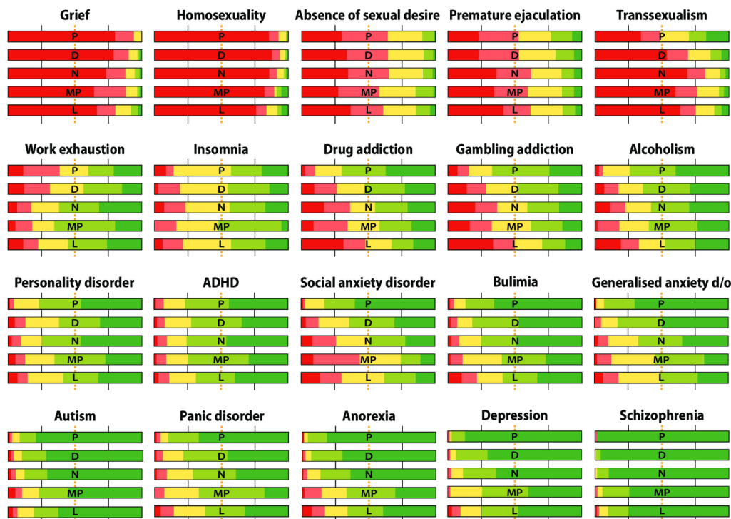
Figure 2 Proportions (divisions at 0.25, 0.5 and 0.75) to the claim ‘this state of being is a disease’ in psychiatrists (P), non-psychiatrist physicians (D), nurses (N), parliament members (MP) and laypeople (L). Dark green represents individuals who strongly agree , light green those who agree to some extent , yellow those who neither agreed nor disagreed , light red those who disagree to some extent and dark red colour those who strongly disagree with the claim. d/o refers to disorder. ADHD, attention deficit hyperactivity disorder.

(absence of sexual desire, premature ejaculation and transsexualism) and states in which there was wide divergence in views (alcoholism, work exhaustion, insomnia, drug addiction, gambling addiction and social anxiety disorder) (box 1 and figure 2). Perceptions differed by group: the inclination to medicalise states of being was highest among psychiatrists and other medical professionals, and lowest among MPs and other laypeople, suggesting considerable divergence between professional and lay conceptions of disease. The magnitude of the difference between psychiatrists and laypeople was substantial: an average difference of more than 10 points on an 80-point scale of inclination to consider a state as a disease. The largest differences between the two groups were seen for social and generalised anxiety disorders and gambling and drug addictions, with psychiatrists being far more likely to define these states as diseases than laypeople. Finally, we found that that younger people and women were modestly more inclined to consider states to be diseases than older people and men were.