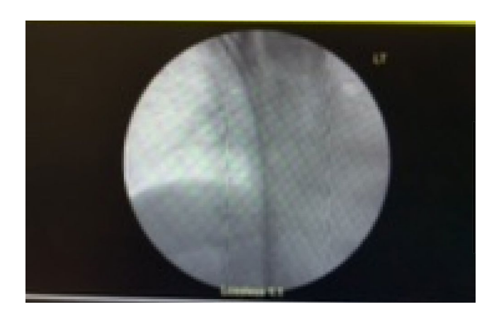
FIGURE 2 Radiograph of cannula in the right internal jugular vein that was advanced through the superior vena cava into the right atrium

not be performed due to the size of the mass. Therefore, cardiothoracic surgery was consulted to assist with cardiopulmonary bypass.