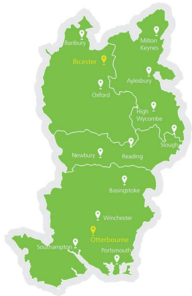
Figure 1. Geographical area covered by South Central Ambulance Service (SCAS).

Data were collected during routine care via an EPR on the MobiMed Smart electronic tablet (Ortivus, Sweden). Each patient attended by the emergency crew or a solo responder had an EPR completed each time they were attended by the EMS. The EPR is designed to collect patient clinical and social history, incident details and clinical information, for example vital signs and clinical