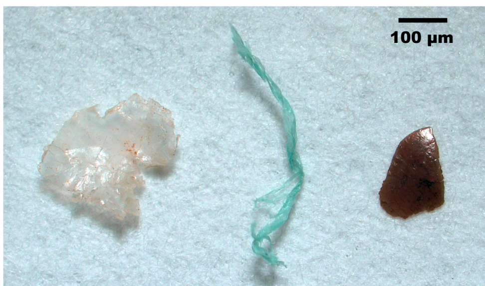
Figure 3. Micrograms of three types of microplastics. The scale bar indicates 100 \mu\text{m} . From left to right: film (FL), fibre (FB) and hard fragment (FM).

Micrograms of FB, FL and FM are given in Figure 3. A total of 362 characterized microplastic items were identified as plastics, and the accuracy of visual identification was 95.4%. Among these microplastics, most were polyethylene (PE; 51.9%) and polyethylene terephthalate (PET; 29.3%). The rest of the polymer groups constituted only a small proportion (Figure 2b). Multivariate analysis demonstrated that there is no significant grouping of samples with respect to their sites of collection (ANOSIM: R = -0.079 ; p = 0.885 ). Types of microplastics were not found to associate with any sample groups.