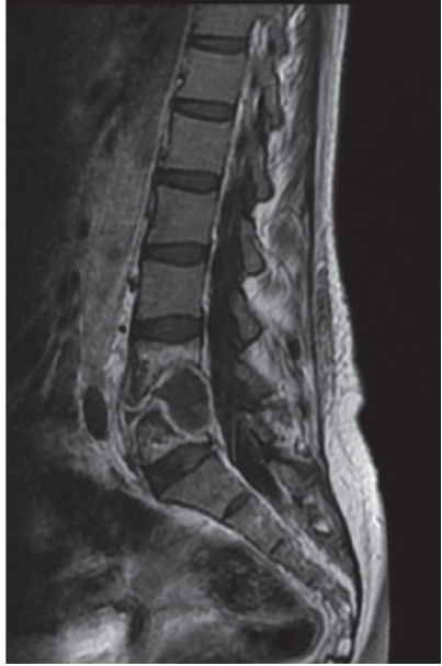
FIGURE 1: Sagittal view of MRI lumbar spine. T1 flair image with contrast demonstrating diskitis and osteomyelitis with expansile mass extending into epidural space.

Upon follow-up at a local TB clinic, she complained of right upper quadrant pain and was found to have elevated transaminases. All of her medications were stopped and a