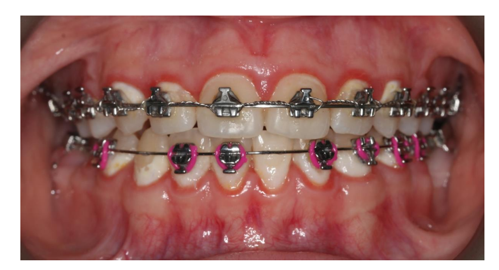
Figure 2. Gingivitis associated with dental plaque.

Insufficient removal of the bacterial biofilm can also cause periodontal diseases, such as gingivitis (Figure 2), periodontitis, recession, or gingival hyperplasia [1,5–7]. The classic methods of preventing the above diseases include, in addition to proper hygiene, ultrasonic scaling (US), periodontal debridement (PD), and oral rinses based on chlorhexidine. However, new alternative methods of reducing plaque around brackets are developing.