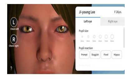
Fig. 3: Pupillary light reflex test

Pupillary light reflex test is performed to determine whether the brainstem region that controls consciousness is functioning normally (28). Three items including pupil size, shape, and response to light are evaluated. To evaluate it, the icons arranged on the left side of the program (left/right examination) are used. Clicking the icon on the relevant area creates a circle figure and penlight icon of various sizes. The size of the pupil can be measured using a circular ruler, and the reaction to light can be observed by illuminating one pupil directly with the penlight. The pupil size ranges from 3 to 8 mm, and the pupillary response can be assessed as prompt, sluggish, fixed, and hippus (Fig. 3).