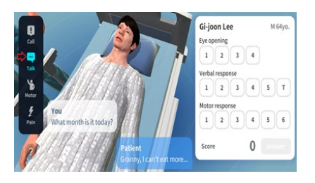
Fig. 2: Glasgow coma scale

patient is not awake or does not follow movement instructions, the patient's response to pain can be assessed by clicking on the pain stimulus icon. Each item is scored between 3 and 15 points, with 1–4 points for eye opening, 1–5 points for verbal response, and 1-6 points for motor response (Fig. 2).