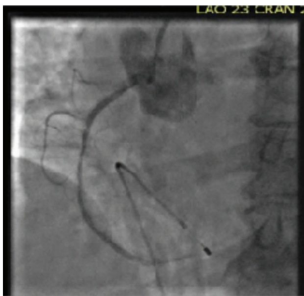
FIGURE 2: Coronary angiography showing the right coronary arteries unchanged from previous angiogram.

a supraventricular tachycardia (SVT) with aberrancy. IV adenosine was given, and the rhythm changed to sinus tachycardia. Concomitantly, the patient developed acute pulmonary edema and became hypotensive and hypoxic. She was intubated, started on mechanical ventilation, and vasopressors were administered to maintain her blood pressure. A coronary angiogram showed patent left and right coronary arteries, unchanged when compared to the previous angiogram (Figures 1 and 2). An echocardiogram performed in the cardiac catheterization lab revealed global hypokinesis of the left and right ventricles, with severe left ventricular