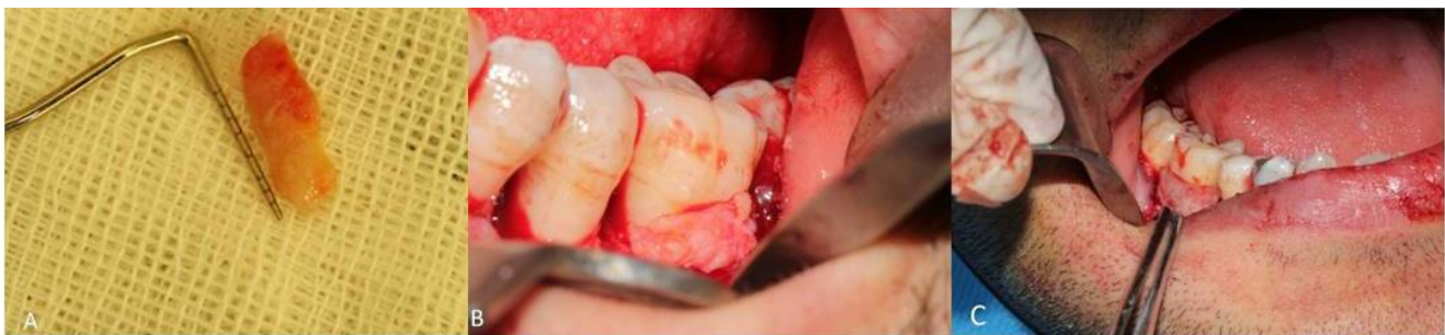
Figure 3. Connective tissue graft (A) adaptation in furcation site defects (B). ADM adaptation in furcation site defects (C).