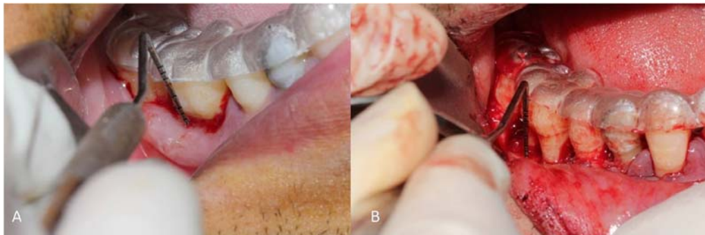
Figure 2. Soft tissue (A) and hard tissue (B) measurement before surgery.

The palatal flap was sutured and covered with periodontal dressing. In both groups, DFDBA (0.5; 150-2000 \mu\text{m} Cortical Cancellous Powder, Tissue Regeneration Corporation, Kish Island, Iran) was used as the graft material. The granules were slightly formed by a sterile spatula. Connective tissue graft one side and ADM (1 \times 1cm; Tissue Regeneration Corporation, Kish Island, Iran) on opposite site were shaped to cover the defect without tension and in a way to be secured on bony margins (Figure 3). Horizontal cross mattress suture was used to stabilize the connective tissue graft and ADM in the desired position and the coronal edges of the flap were sutured using the 0-4 silk suture using interrupted technique.