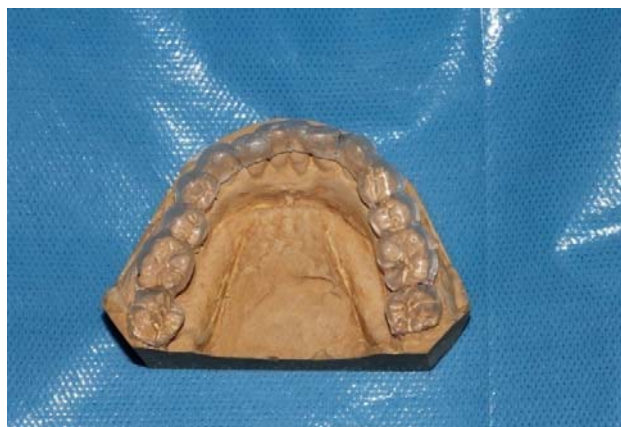
Figure 1. Prefabricated acrylic stent.

Clinical parameters including probing pocket depth, clinical attachment level, and gingival margin position were recorded using the acrylic stent and a UNC-15 periodontal probe. To ensure perfect alignment of the acrylic index in place, the method of determining the distance to CEJ was used in the acrylic structure. Also for reproducible and reliable soft and