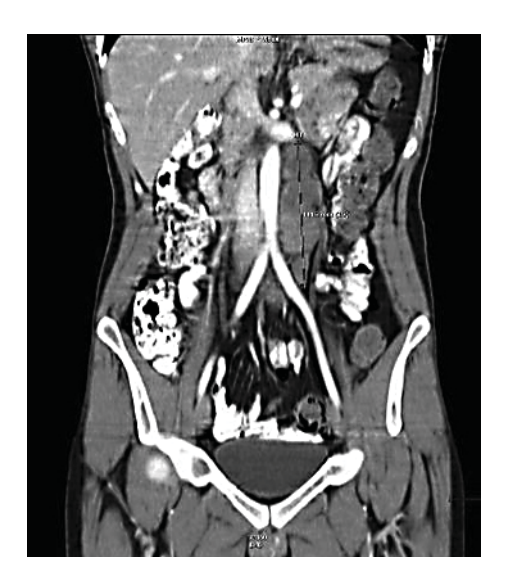
Fig. 2. Abdominal CT scan showing a retroperitoneal mass on the left side of the aorta compressing the left renal vein.