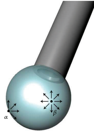
FIGURE 1: Droplet of water at the end of a pipette. Molecule \beta , which is positioned inside the droplet, is equally attracted in all directions. Molecule \alpha , which is located on the surface, is exposed to more attractive forces inside rather than outside the droplet, and the resultant attractive force is thus inwards. Surface tension acts like a film as it tries to achieve the smallest surface area for a given volume (modified from Kirchhof and Wong [74]).

Surface tension is a contractive tendency of the surface of a liquid that allows it to resist an external force; it generally refers to the energy between a liquid and air. Surface tension is also known as “interfacial energy” when it occurs at the interface between two immiscible liquids. The surface tension of the gas or silicone oil is an important factor that prevents the bubble of the tamponade agent from prolapsing through the retinal break, thus facilitating sealing of the break. The physical chemistry of interfaces is complex. Molecules of a liquid are attached to each other by van der Waals forces. In some liquids, such as water, there are also intermolecular polar bonding forces due to an asymmetric distribution of charges between the molecules (Figure 1). On the other hand, in gases, the van der Waals forces are negligible. Thus, at the interface of a fluid and a gas, half of the molecular neighbors