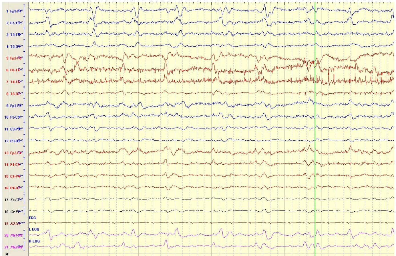
Figure 2 Bilateral independent periodic discharges (BIPDs, formerly known as bilateral independent periodic lateralised epileptiform discharges). The electroencephalogram (EEG) showed BIPDs are present over the bilateral temporal areas independently (unsynchronised). This EEG was obtained from a 34-year-old man with subarachnoid haemorrhage and several generalised tonic-clonic seizures.

effects, and some data also suggest that prophylactic use of AED therapy may be associated with poorer outcome. 60 However, most of the prophylactic AED therapy trials were using older generation AEDs, and newer generation AEDs have fewer side effects and improved drug-to-drug interaction profiles. Therefore, more prospective, randomised and controlled studies with newer generation AEDs need to be implemented in the future. Besides the traditional AEDs, several stroke preventive and other medications have been reported to have an effect on reducing the risk of PSS. Diuretics, for example, thiazides and furosemide, have been reported to show protective effects against seizures in animal models, and in observational epidemiological studies diuretics seem to reduce the risk of seizures in patients. 5 60 Statin also has been studied for its antiepileptic effects. 5 61–63 Guo et al 62 found that statin use was associated with reduced risk of epilepsy among patients with ES after stroke. Etminan et al 63 reported that statin use in patients with cardiovascular illness reduced the risk of subsequent hospitalisation for epilepsy. It has been suggested that statin antiepileptogenic effect may be related to its anticonvulsant potential, or anti-inflammatory effect or effect on brain blood barrier (BBB) injury. Theoretically, mitigation of