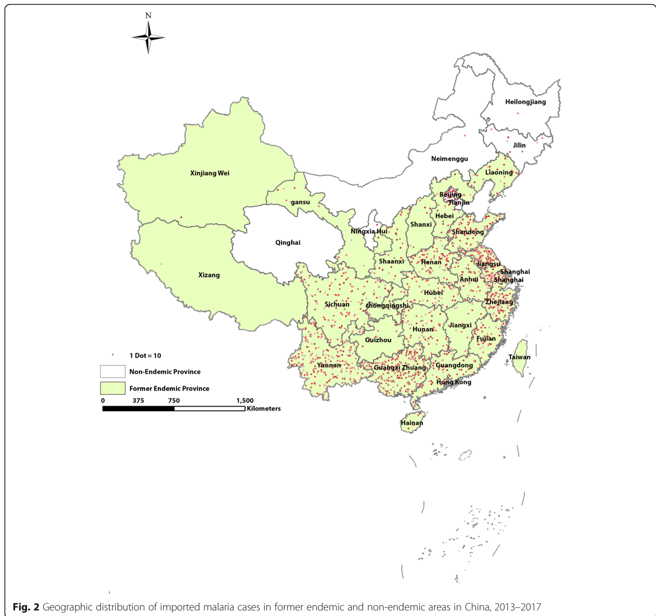
Fig. 2 Geographic distribution of imported malaria cases in former endemic and non-endemic areas in China, 2013–2017

Workers from former endemic areas are exposed to the same conditions in Africa as workers from former non-endemic areas. An explanation might be that the typology of work for travelers differs between those coming from former endemic and former non-endemic areas, more outdoor workers coming from the former and more inside workers coming from the latter. Another main difference can be observed. In former non-endemic areas patients are almost exclusively traveling to Africa (94%) whereas in former endemic areas only 80% are working in Africa and 19% are working in Southeast/South Asia. The most plausible reason for this difference is that some of former endemic areas are located along the Southern Chinese border and have thus established partnership with Southeast/South Asian countries with a