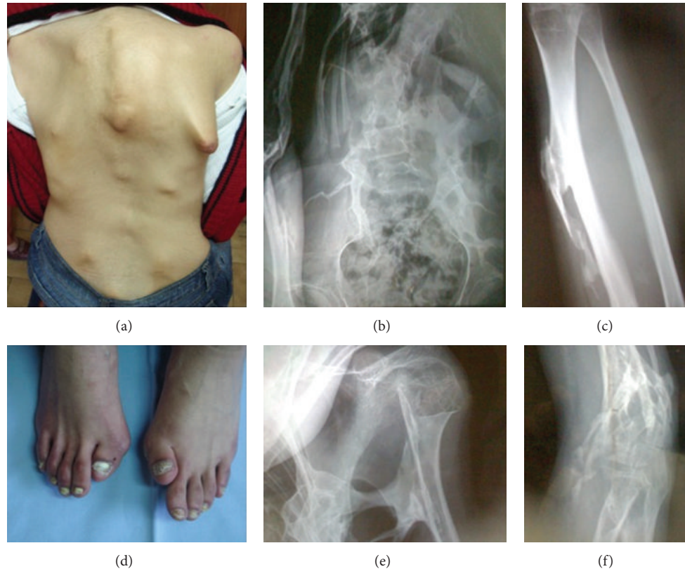
FIGURE 1: Clinical photograph. (a) Heterotopic ossification of the right scapular area, which functionally limited patient movement. Note the presence of pseudotumours of soft tissue at different locations in the back. (b) Column radiography showing abnormal calcification and “pseudoxostosis” indicating ligament ossification at the site of attachment. (c) Right forearm with cubit exostoses dependent on ligaments and aponeuroses. (d) Congenital malformations of the great toes. (e) Radiography of the right scapula and (f) right elbow shows abnormal calcification dependent on ligament ossification.

stated that the patient exhibited malformation of the great toes at birth. At the age of 8, the patient developed spontaneous and painful swelling in the right scapular area accompanied by a functional limitation of movement; her clinical laboratory abnormalities included increased serum alkaline phosphatase activity. Radiography demonstrated abnormal calcification and “pseudoxostosis” that was dependent on ligament ossification at the site of attachment to the long bones (Figure 1).