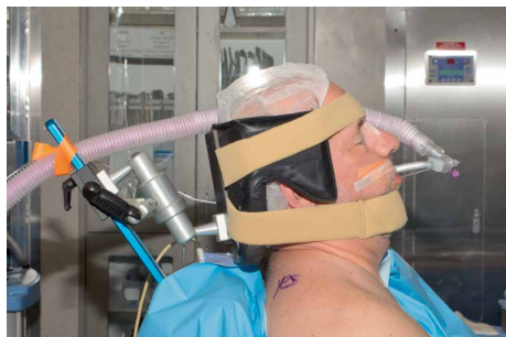
FIGURE 1: Positioning of head and neck during the beach chair position, secured via soft Velcro strap across forehead and around the chin.