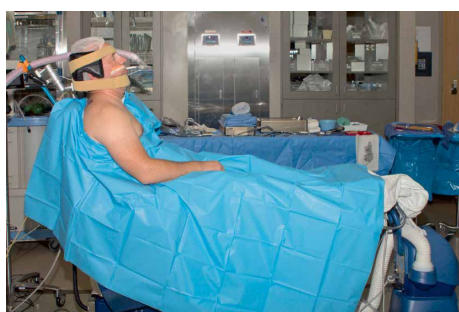
FIGURE 2: A typical beach chair position at our institution.

sensation. The neurology service was consulted and rendered a diagnosis of isolated right hypoglossal nerve palsy. Eight days after surgery, the patient noticed marked improvement in his symptoms, except slight tongue deviation to the right. All symptoms resolved by six weeks postoperatively (Table 1).