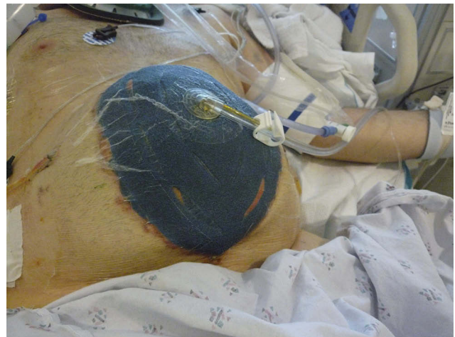
Figure 3 A clinical image of a patient with aortic injury subjected to damage control laparotomy with temporary abdominal closure using negative pressure wound therapy (NPWT).

Delaying primary fascial closure beyond 7 days poses significant risks of increased complications. 77 When primary tension-free fascial closure fails, different surgical