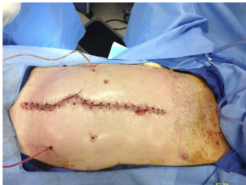
Figure 5 Clinical images of a patient subjected to split-thickness skin graft as a temporary abdominal closure after achieving successful treatment of enteroatmospheric fistulas, and to definitive fascial closure after 3 months. Note: Photo courtesy of Peep Talving.