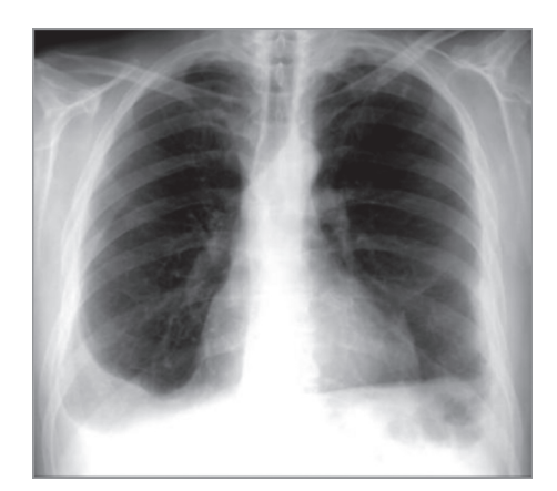
FIGURE 1: Chest radiography showing right-sided pleural effusion and left diaphragmatic retraction.