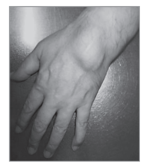
FIGURE 3: Subcutaneous rheumatoid arthritis nodule.

Pseudochylothorax (chyliform or cholesterol pleurisy) is a rare pleural effusion with milky appearance because of its high lipid content. Typically, the pleural fluid cholesterol level is greater than 200 mg/dL, the triglyceride level is below 110 mg/dL, the cholesterol/triglycerides ratio is >1, and cholesterol crystals are present [12, 13]. The last two parameters seem to be the most sensitive to establish the diagnosis [13]. Tuberculosis is by far its most frequent cause, followed by RA. A recent systematic review revealed that