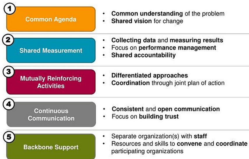
FIGURE 2: Five elements of the collective impact model.

Adapted with permission from the authors [25].