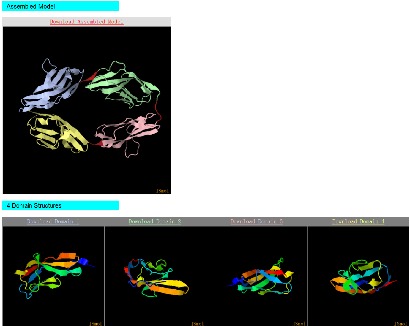
Figure 2. Assembly result for four continuous domains of N-terminal fragment of axonin-1 from chicken.

From the initial model, AIDA attempts to perturb the linker conformation, which results in the different arrangement of domain structures. Linker conformation change (i.e. movement) is accepted only if the total energy of the new full-length model is lower than that of the previous model. The program will stop if the total number of attempts exceeds 1000L (where L is the length of the entire sequence) or 200 consecutive movements have failed (indicating that the model reaches the global/local minimum state).