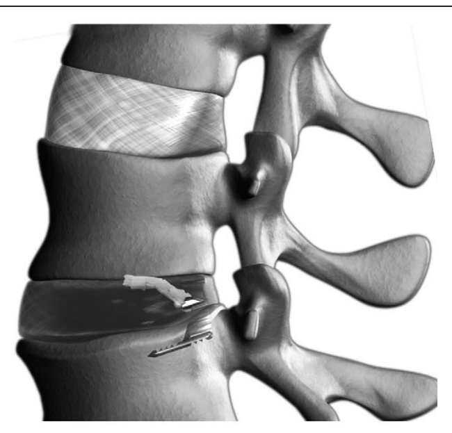
Figure 1. The Barricaid annular closure device. The device is comprised of a flexible polymer occlusion component that is attached to a titanium bone anchor.

mass index, smoking history, level of herniation, average disc height, herniation type, back pain severity, leg pain severity, and ODI. We will also obtain patient-level data from the EU Barricaid Controls for these variables from the study sponsor. We will then calculate propensity scores using binomial logistic regression to estimate the probability that patients would be enrolled in the US Barricaid trial. Propensity score adjustment using inverse probability of treatment weighting (IPTW) will be used to control for potential baseline covariate imbalances between study groups, thereby providing unbiased estimates of average treatment effects. Compared with other methods of propensity score adjustment such as stratification, matching, or covariate adjustment, IPTW is preferable for the analysis of differences in proportions,<sup>[20]</sup> which coincides with the planned primary endpoint analysis of this trial. We will verify the performance of the propensity score model by comparing the distribution of covariates between study groups before and after propensity