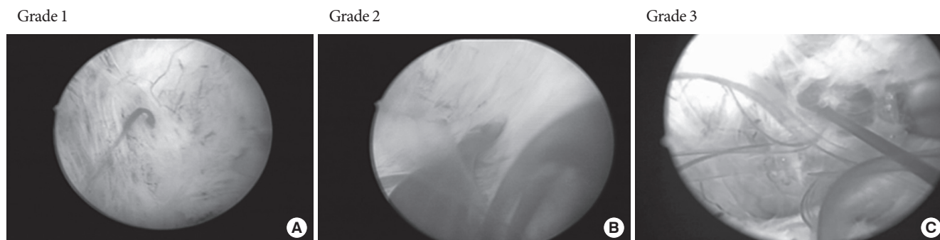
Fig. 1. Grading of bleeders. (A) The grade 1 bleeder was assumed to be arterial but was easily coagulated. (B) The grade 2 bleeder interfered with the surgical procedure, but was easily coagulated, or when the bleeding was not severe, but coagulation was prolonged. (C) The grade 3 bleeder was definitive pumping artery that completely obscured the operative field and coagulation was difficult and time-consuming.

of bleeder was defined as \geq 10 significant bleeders.