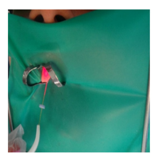
Figure 1. Intracanal application of diode laser.

Each root canal was obturated with the modified single cone technique using the ProTaper Universal gutta-percha points size F4 and gutta-percha points size 25 (META, Biomed, Republic of Korea) as auxiliaries with ADSEAL resin-based root canal sealer (META BIOMED CO., LTD. Chungbuuk, Korea). All the teeth were restored with IRM as a temporary filling. At the end of the second visit, all patients were instructed to record pain level on the pain scale chart after 6, 12, 24 and 48 hours and after 7 days. The patients were instructed to submit the pain scale charts after the 7<sup>th</sup> day. Patients were referred for final restorations. Any patient who reported the intake of an analgesic during this period was excluded from the study.