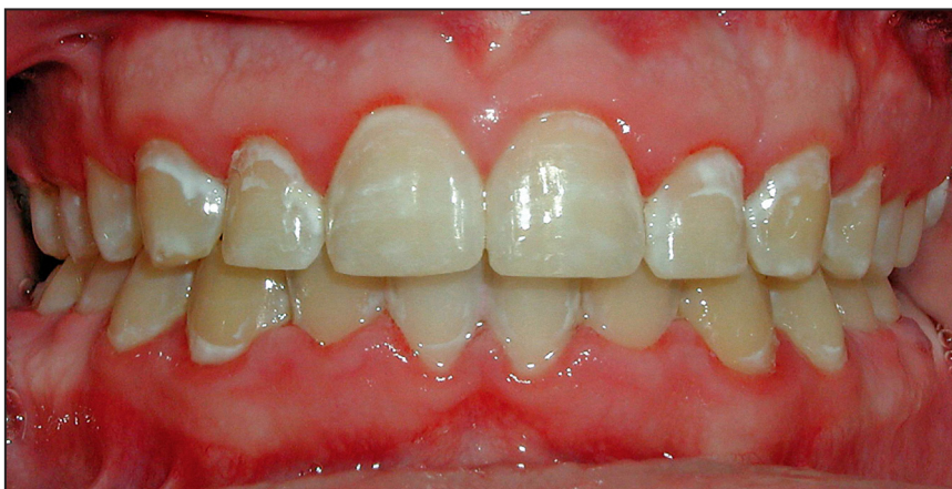
Figure 1. White spot lesions after orthodontic treatment with fixed appliances.

Evaluating the results of scientific researches hypothesis arises if it is possible to prevent