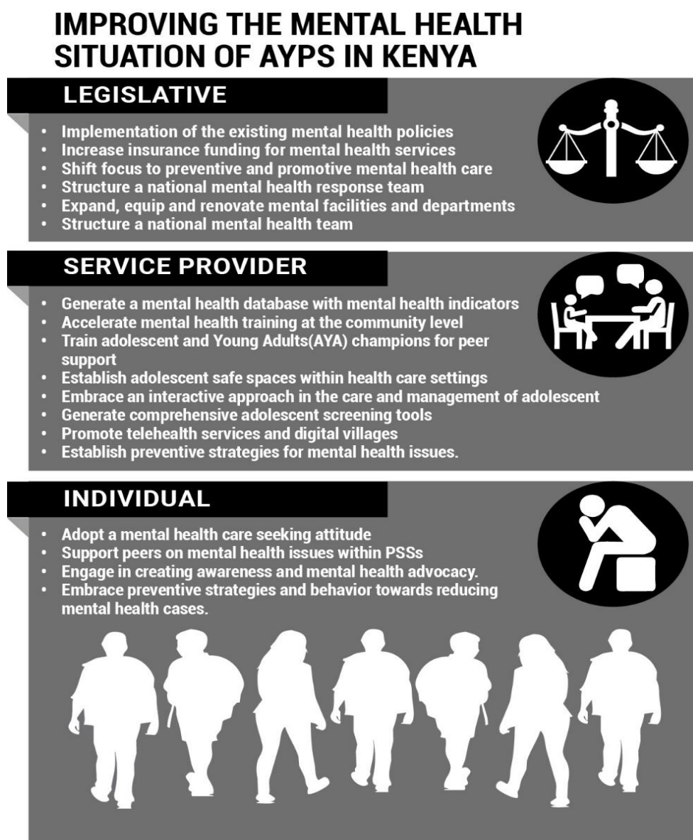
Figure 2. The image illustrates the stakeholders' recommendations for improving the mental health situation of AYP in Kenya.

adolescent youth champions, (5) interactive service provision models, (6) implementation of the existing mental health policies and structures, (7) the development of comprehensive assessment tools, (8) well-equipped mental health departments in health facilities, (9) the enhancement of telehealth services and digital villages, (10) the establishment of a functional mental health response team, and (11) the development of a mental health database. The proposals were considered within the same clusters established while identifying the mental health challenges, as indicated in Figure 2.