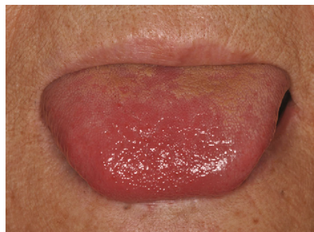
FIGURE 1: The apex of the tongue showing slight redness.

The cardiologist took blood cultures, which were negative for bacteria, and an ultrasound cardiogram and transesophageal echocardiography showed neither clear vegetations nor regurgitation. For the remittent fever of more than 38.0°C, the patient was admitted to the cardiology clinic three days after the first visit and underwent a complete examination. Serum examination showed the following: PR3-ANCA < 1 IU/mL, MPO-ANCA 124.0 IU/mL, cytomegalovirus complement fixation test 8, ferritin 471 ng/mL, and CH50 60.0 U/mL. Sputum cultures, acid-fast bacterial cultures, and fecal cultures were negative. CT imaging showed no abnormal findings causing fever, and deep vein thrombosis was not found on ultrasonography of the veins of the lower