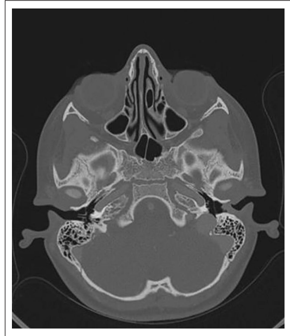
Figure 3. Axial CT image (after treatment) identifies complete resolution of the lesions in right ear and tympanostomy tube.

T2 scans on the right side (Figure 1). Subsequently, the ear, nose, and throat department was consulted. Otoloscopic examination showed bulging of the right tympanic membrane without any tenderness in the retroauricular area and mastoid. Temporal computed tomography (CT) was performed, which showed complete opacification in the mastoid air cells and middle ear. In addition, the CT images showed erosion in the petrous apex indicative of petrous apicitis on the right