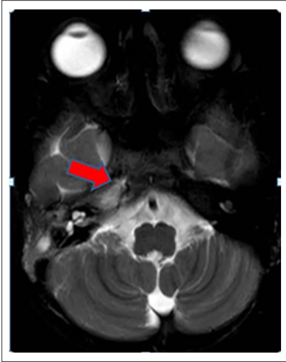
Figure 1. Axial T2 weighted MR image (before treatment) shows hyperintensity in right mastoid cells, middle ear and also petrous apex.