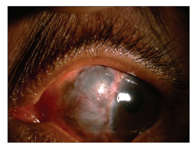
Figure 3: Six months after corneo-scleral patch graft following infectious scleritis post-cataract surgery (Case 8)

abscesses (P = 0.209). The addition of surgical intervention did not result in a significantly better visual outcome than medical management alone (P = 0.209), but resulted in a higher rate of globe preservation (P = 0.045).