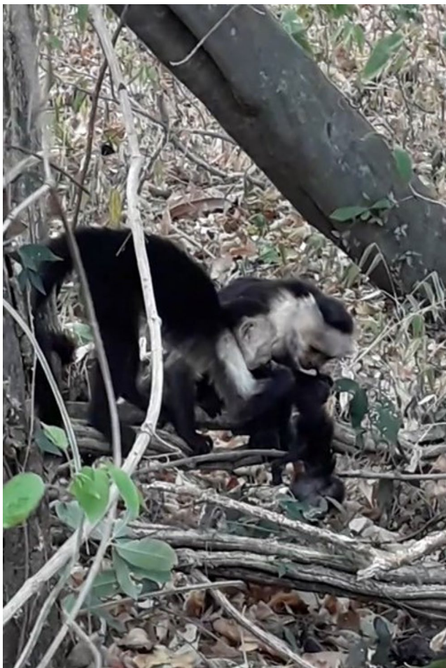
FIGURE 1 Adult female (right, SS) and juvenile male (left, BS) holding and eating the dead infant (CT-19)

The discarded corpse attracted attention and investigation from two adult males and adult females, including the mother, who approached and emitted vocalizations (alarm calls and trills; Gros-Louis et al., 2008) and facial threats toward the corpse (Video S2). At 15:57, all group members left from the area, moving away to forage. After 15 min during which none of the monkeys returned, we collected the remains of the corpse for photographs.