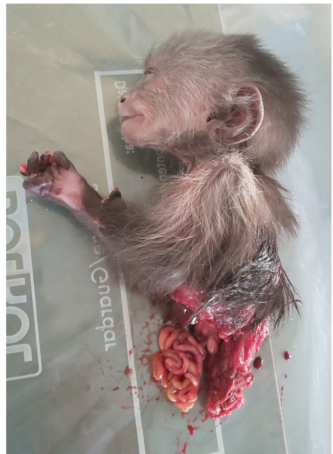
FIGURE 2 Remains of infant corpse following observed case of cannibalism in white-faced capuchins

Following the death of their young infants, female capuchins usually carry them for many hours (e.g., Schoof et al., 2014), a behavior that is even common for primiparous females (Perry & Manson, 2008). In the case we report here, although the mother presented herself to the infant, she made no attempt to carry it when it was unable to cling to her. A possible proximate explanation for the