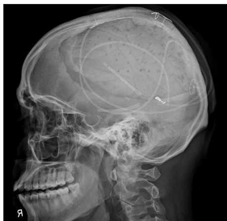
Fig. 3. Lateral view of skull X-ray shows coiling of whole shunt catheter.