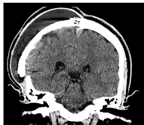
Fig. 1. Brain computed tomography reveals the big right subgaleal fluid collection, pseudomeningocele.

the cranioplasty, the scalp progressively grew due to leakage of the cerebrospinal fluid (CSF) into the subgaleal space (Fig. 1). Conservative treatments such as direct aspiration of the CSF followed by compression with elastic bandage and continuous lumbar drainage were not effective. The patient underwent SP