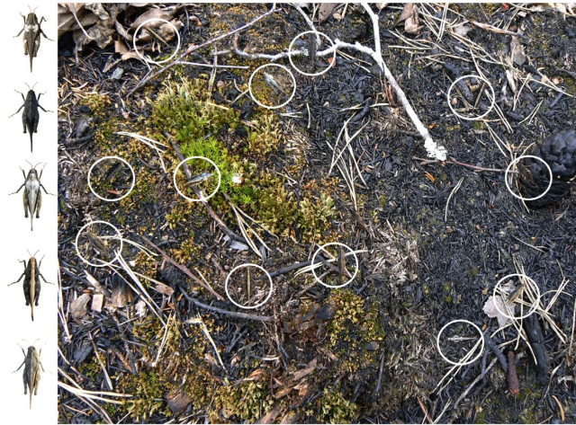
Figure 1. Prey and visual background used for the detection experiment. (Left) The five colour morphs of Tetrax subulata grasshoppers used as prey. From top to bottom: transversal bar, black, grey, striped and brown. Photos by Einat Karpestam. (Right) An example of tetramorphic image used in the detection experiment. The 12 white circles have been added afterwards to indicate the location of the grasshoppers in the image. This image represents a tetramorphic population consisting of the grey, black, striped and brown colour morphs. Grasshopper size was scaled to 12 mm and was in proportion to the distance from which the background image was photographed. Photos by Einat Karpestam.

Percentage of populations that went extinct. The proportion of prey populations that went extinct decreased in a curvilinear decaying manner with increasing levels of polymorphism (GLMM, linear effect of polymorphism level: F_{1,278} = 6.57 , P = 0.0109 ; curvilinear quadratic effect of polymorphism level: F_{1,278} = 5.22 , P = 0.023 ; random effect of subject: estimate = 0.43 \pm 0.37 SE; Fig. 2b).