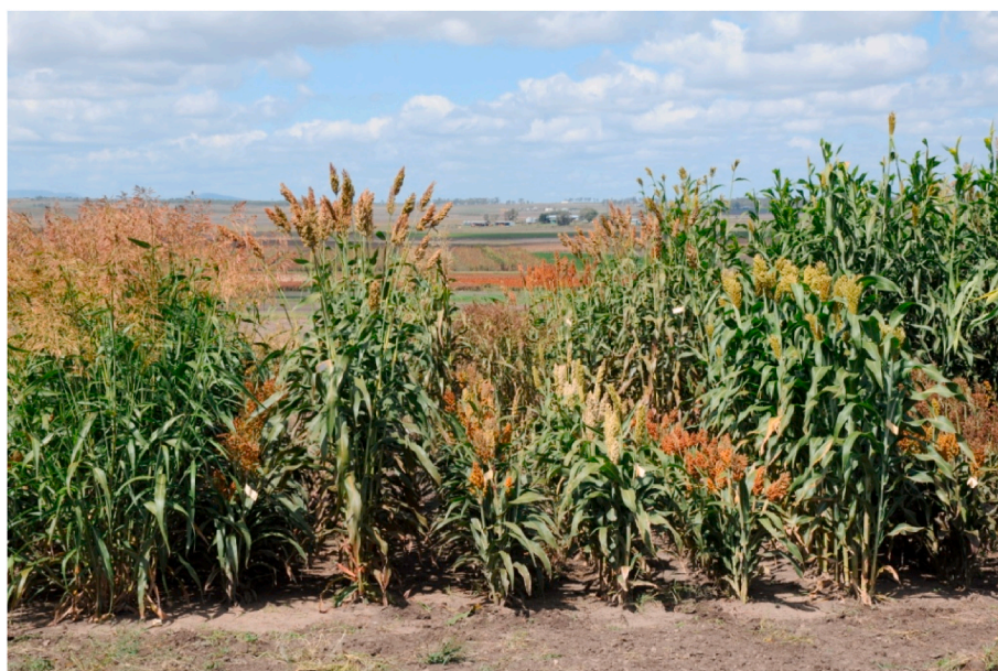
Fig. 1. Access to and use of genetic sequence data from highly diverse germplasm creates opportunities for conservation of biodiversity and innovation for biotic and abiotic stress management.

GSD is only valuable if it can be used by researchers and breeders to develop enhanced varieties and to uncover new biological information about the crop. Cassava researchers have established open access