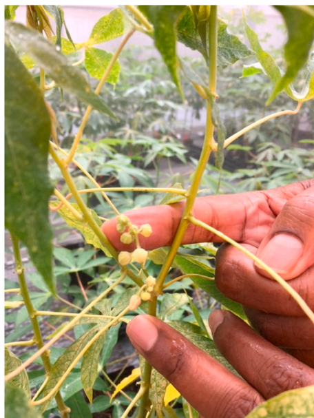
Fig. 2. Flowering in cassava plants, shown in this photo, is inconsistent and male and female flowering is often not synchronized, thus preventing breeders from making crosses. Sharing of genetic sequence data has helped the global cassava research community identify control mechanisms which improve synchrony of flowering, giving breeders greater opportunities for yield and quality improvements.

Pearl Millet. Pearl millet is an important crop in low-input farming systems in some of the hottest and driest agro-ecologies in the world. Harnessing GSD and other crop improvement tools can accelerate genetic gain and productivity in these drought-prone regions (Kumar et al., 2021). Genetic sequencing and knowledge development from diverse cultivars, landraces, and mapping populations of pearl millet breeding lines from 27 countries (Sehgal et al., 2015) have been brought together within the "Pearl Millet inbred Germplasm Association Panel", and provide valuable material for genome sequencing (Varshney et al., 2017). By accessing these publicly available resources (Cegresources.