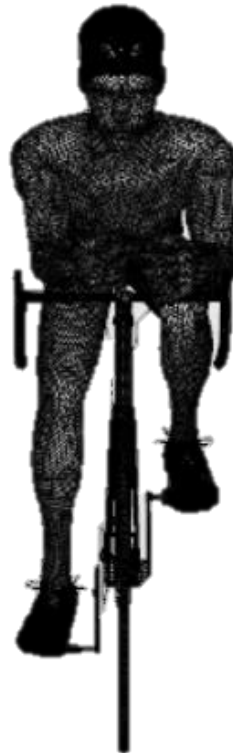
Figure 1. The meshed geometry in the aero position.

The subject and bicycle were scanned in the aero position (Figure 1). The cyclist wore racing clothes, shoes and helmet, and used his own bicycle. The subject was asked to maintain a static position during scanning. The bicycle was placed and fixed on a roller.