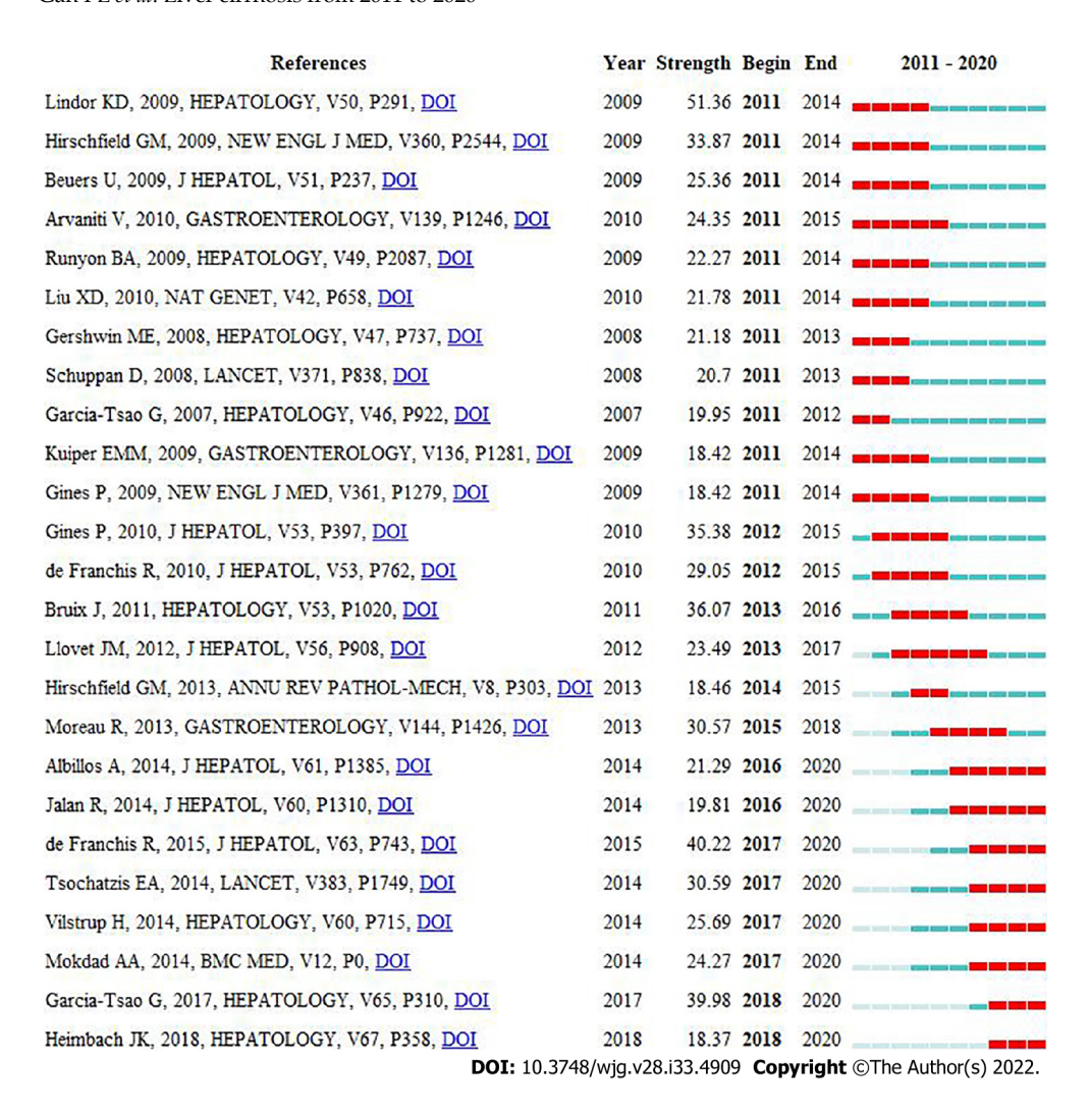
Figure 4 References with the strongest citation burst on cirrhosis research.