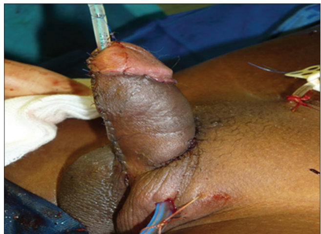
Figure 3: Immediate post-operative aspect