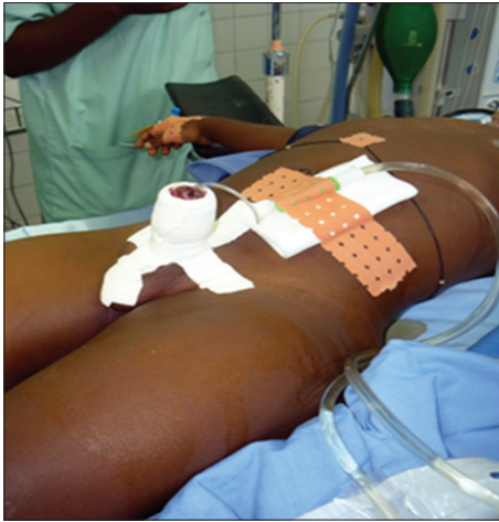
Figure 4: 'Marguerite' dressing