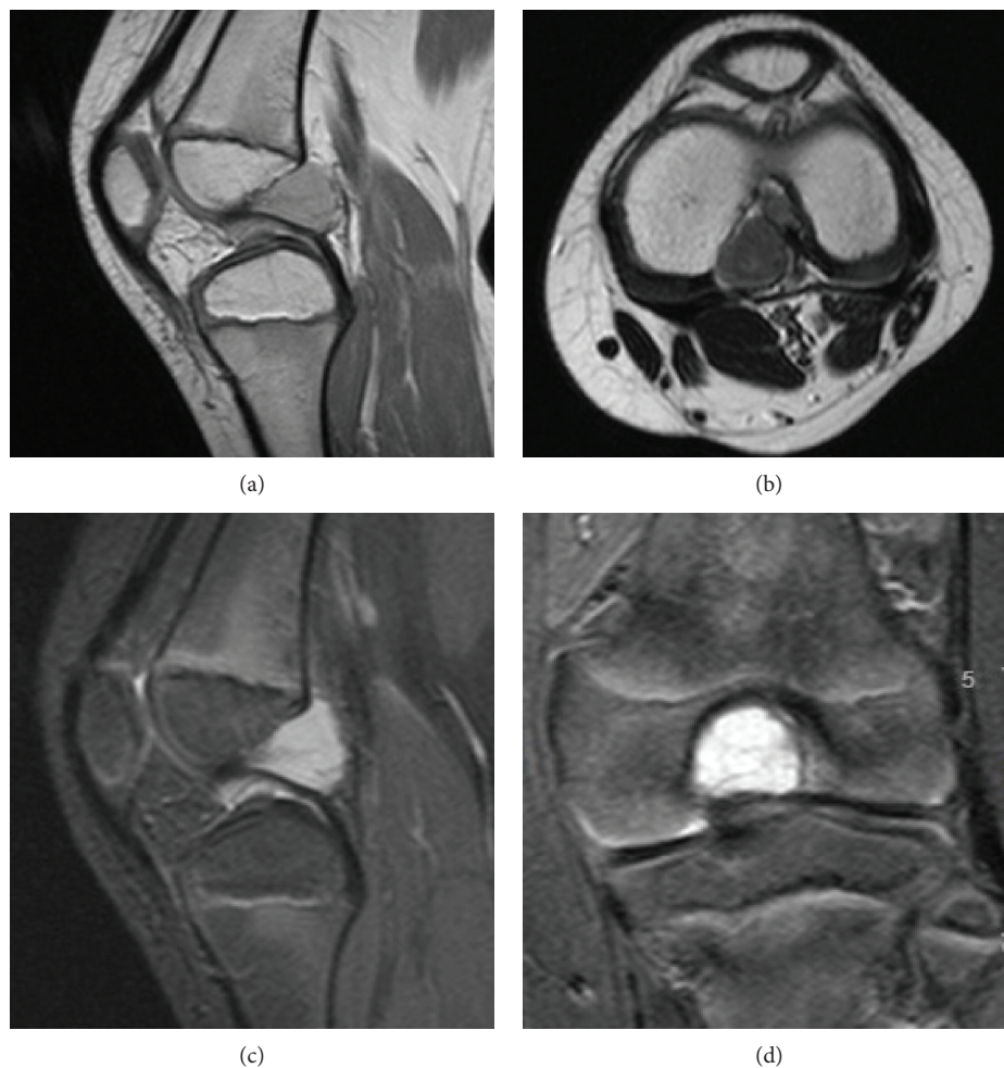
FIGURE 1: Preoperative magnetic resonance images of the left knee revealed large round-shaped cystic mass encasing the PCL with homogeneous low-signal intensity on sagittal proton density-weighted image (PDWI) (a) and on turbo spin echo (TSE) imaging (b). The lesion appears highly hyperintense on sagittal and coronal turbo inversion recovery magnitude (TIRM) images (c, d).

varus/valgus stress tests were all negative. Plain radiographs were performed and resulted normal. A second-level imaging was needed, but the presence of ASD complicated the execution of the test, so MRI of the left knee was performed under general anesthesia with sevoflurane. Scans revealed a 29 mm × 16 mm × 17 mm well-defined septated cyst located in the intercondylar notch between the ACL and PCL, abutting predominantly posteriorly to the PCL. The round-shaped cystic mass encasing the PCL depicted homogeneous low-signal intensity, slightly hyperintense relative to the muscles, on proton density-weighted image (PDWI) and on turbo spin echo (TSE) imaging and high-signal intensity on turbo inversion recovery magnitude (TIRM) images (Figure 1).