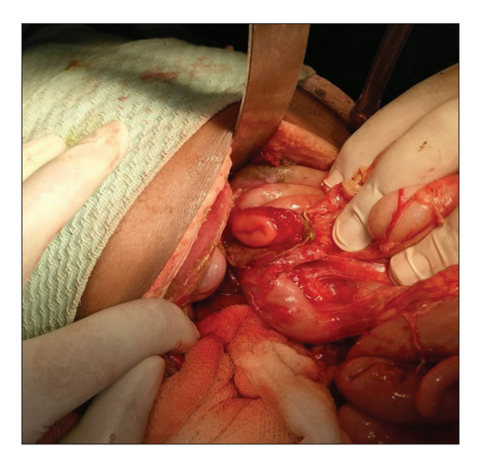
Figure 4: Complete transaction of the duodenum due to blunt abdominal trauma

duodenal ulcer and perforation following ingested lollypop stick. The aetiologies of perforation in 2 (22.2%) children were unknown [Figure 1].