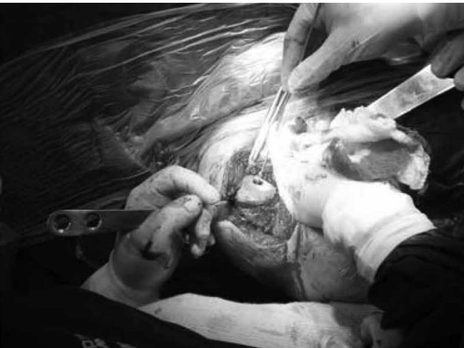
Figure 2 – Humeral head drilled after specific guidance.