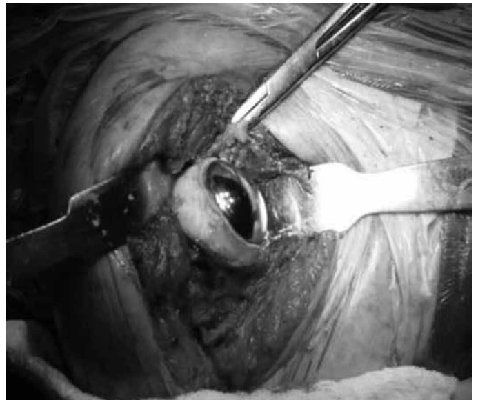
Figure 6 – Final implant of arthrosurface in position.