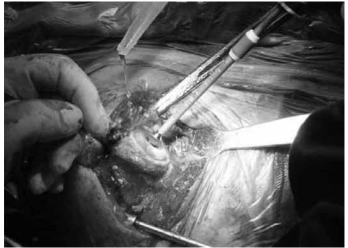
Figure 3 – Preparation of the humeral head using a specific circumferential rasp.