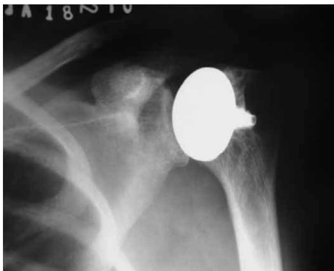
Figure 7 – Control X-ray image showing implant covering the entire compromised area of the humeral head.