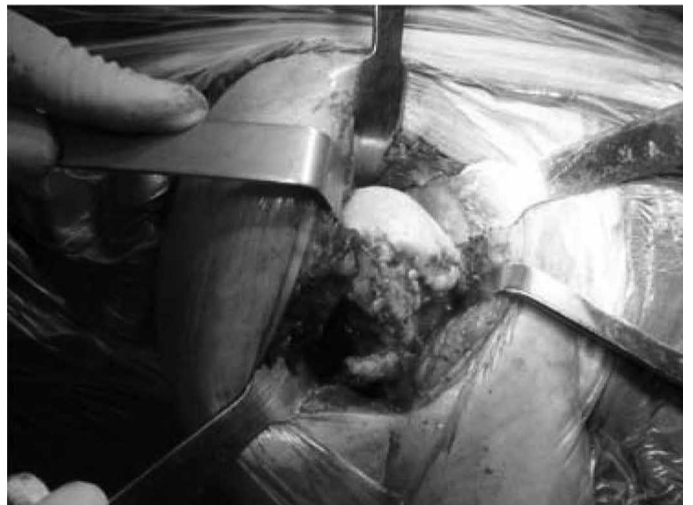
Figure 4 – Humeral head prepared with a threaded pin for the final implant.