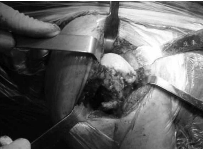
Figure 1 – Degenerative pathological condition in the proximal humerus seen after dislocation maneuver.