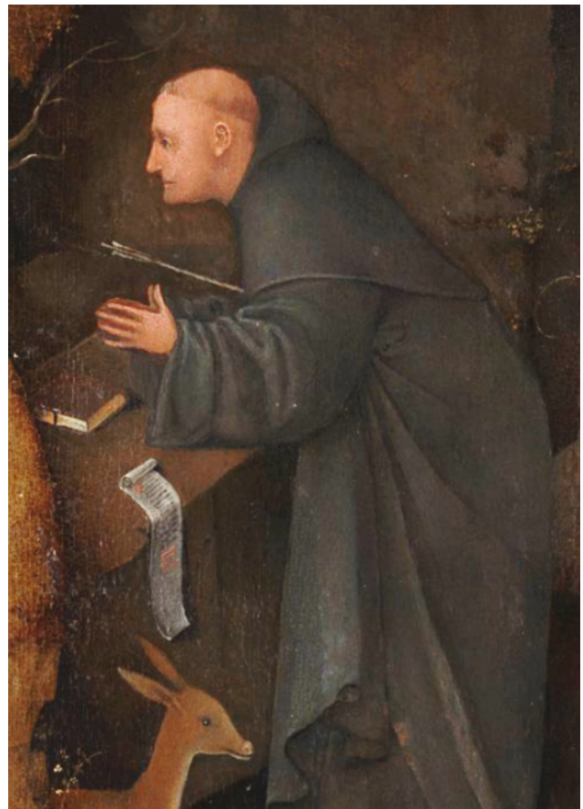
Figure 3 Detail of the right panel of The Triptych of the Hermit Saints by Hieronimus Bosch (1493), Gallerie dell'Accademia, Venice, Italy.

In the painting, The Triptych of the Hermit Saints (Figure 3), St. Jerome, St. Antony, and St. Giles are depicted on the 3 separate panels. All the 3 Saints are old men, a risk group for pneumococcal pneumonia. The Triptych is a painting of Hieronimus Bosch, one of the greatest Dutch painters. All of his paintings depict scenes beyond imagination, and even 600 years after his death, the debates on the interpretation of his works continues. Triptych of the Hermit Saints is on permanent display in the Gallerie dell'Accademia, Venice, Italy, but was brought to "s Hertogenbosch in 2016 on the occasion of Bosch" 600th anniversary. The center panel depicts St. Jerome kneeling in a desert-like landscape and surrounded by symbols of evil. In the left panel, St. Anthony, the