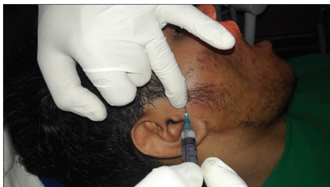
Figure 2: Intra-articular steroid injection

Following this, two 20G needles were then inserted into the superior joint cavity through the points marked. Through one needle, Ringer's lactate solution was injected and the second needle provided an outflow for the solution. A total of 100 ml of solution was used for lavage. After completion of the lavage, the needles were removed and the patient's jaw gently manipulated in the vertical, protrusive, and lateral excursions. The patients were given written and verbal postoperative instructions [Table 1].