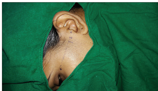
Figure 1: Holmund-Helsing line

Local anesthetic (2% lignocaine with 1:80,000 adrenaline) was injected at the planned entrance points using a 23G needle.