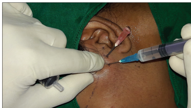
Figure 3: Arthrocentesis

The comparison of VAS pain scale, mouth opening and clicking between intra-articular steroid and arthrocentesis group at various points of time is represented in Table 2. The mean VAS 3 months postoperatively in both the groups differed significantly ( P = 0.002 ). However, there was no significant difference in the amount of mouth opening achieved upon comparison of both the groups at different points in time. Reduction or disappearance of clicking in