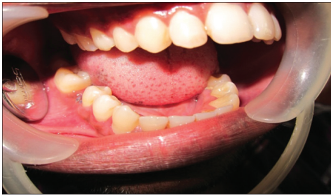
Figure 5: Post-operative intraoral picture after 1-month.

straw colored fluid while the cyst fluid may have shimmering gold appearance when light pass through it. 6