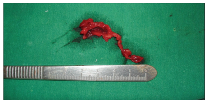
Figure 3: Specimen of enucleated cyst.