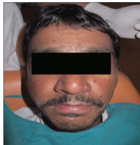
Figure 4: Pre-operative extra oral photograph.