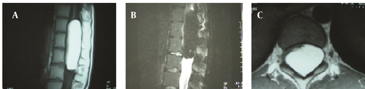
Figure 2. MR Images of Case 2. A pre-contrast T1-weighted sagittal MRI, showing a high signal intensity tumor from Th10 to L1 level (A). The signal intensity dropped dramatically with fat saturation technique, confirming fat as its main component (B). Axial T1W image demonstrates the mass located in an intramedullary position (C).