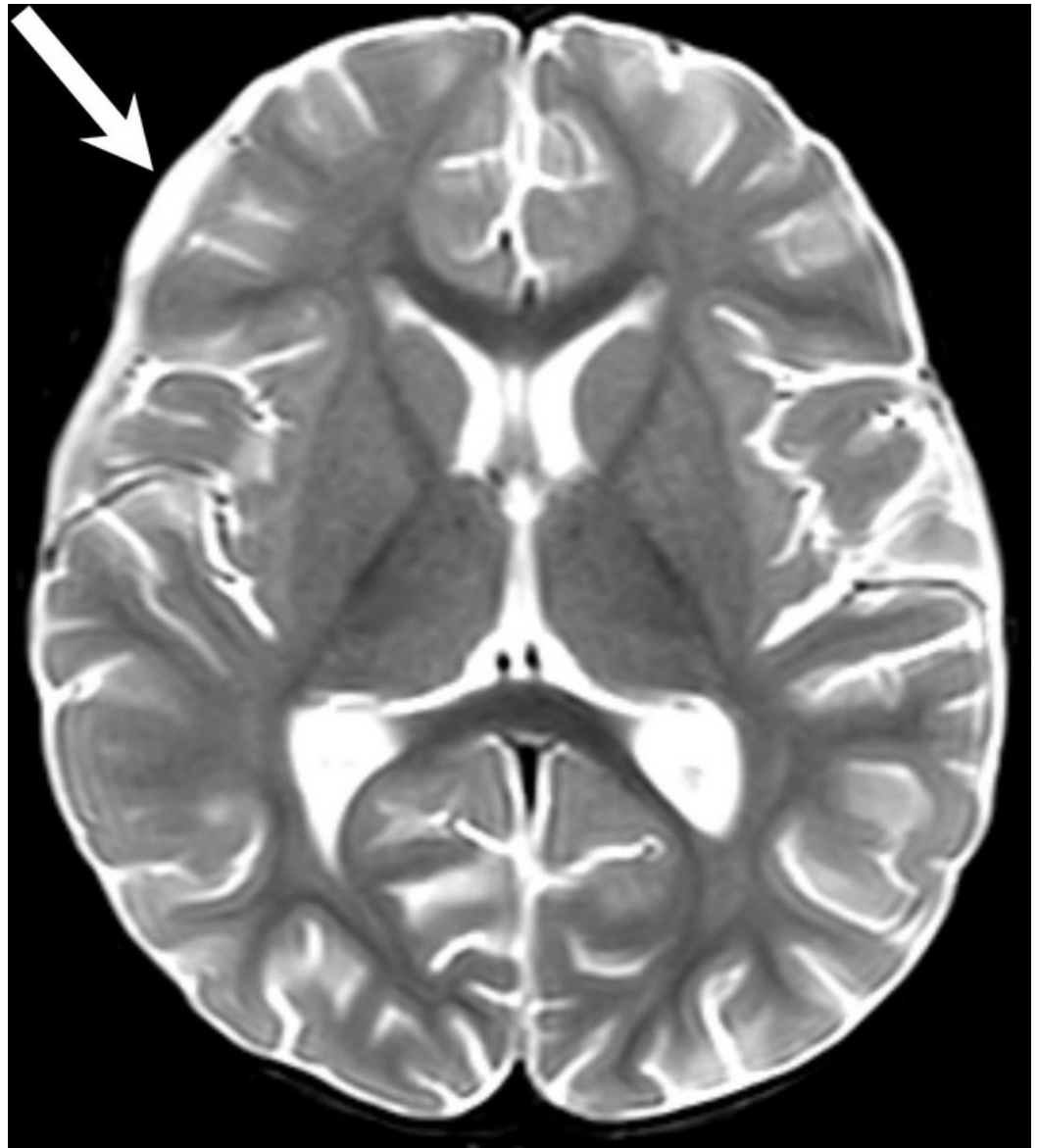
FIGURE 1: Axial, T2-weighted MRI showing bilateral subdural empyemas over the bilateral cerebral convexities most prominent in the right frontal region (arrow) which required right burr-hole craniotomy.

Right-sided burr-hole craniotomy was performed to drain the empyema for further source control; cultures of the purulent drainage were negative. The central venous thrombosis was treated with heparin infusion with transition to enoxaparin. Repeat MRI showed improving empyema (Figure 2), but persistent labyrinthitis (Figure 3). Given the severity of her presentation, immunological studies (Table 1) were performed and confirmed she was immunocompetent and had responded to her previous Hib vaccination. To assess for functional asplenia, a blood smear was performed and showed no Howell-Jolly bodies.