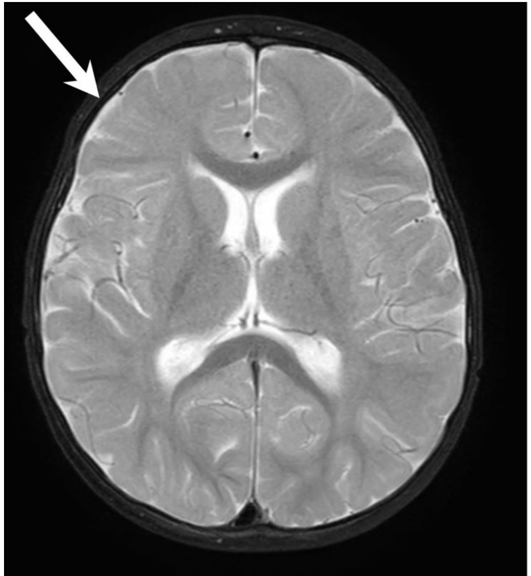
FIGURE 2: Axial, T2-weighted MRI showing resolution of bilateral subdural empyemas (arrow) as compared to the previous figure.