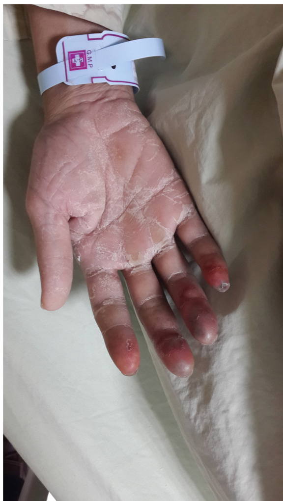
Fig. 1 Acrocyanosis on day 9 after admission

pulses were palpable in both the upper and lower extremities. The results of laboratory tests for SPG, comprising infection, malignancy, and the autoimmune system, were unremarkable (Table 1). Transesophageal echocardiography, carotid Doppler ultrasound, and sonography of the upper extremity vessels also were unremarkable. The patient was administered two doses of oral aspirin 75mg/day and two doses of oral pentoxifylline 400mg/day for 20 days. Because of upper GI tract bleeding noted on admission, heparin was not considered. The gangrenous lesion was kept warm and was not touched, as much as possible. The patient's condition improved steadily over the next 7 days. His pain decreased, and his range of motion improved. Gradual desquamation of his finger skin occurred, with shedding of gangrenous scabs from the tips of his fingers and complete resolution (Fig. 2a, b). The patient was discharged from the hospital stay 26 days later. The patient responded well to the treatment and returned to his normal daily activities during outpatient follow-up.