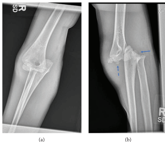
FIGURE 1: AP (a) and attempted lateral (b) radiographs of the right elbow demonstrating anteromedial elbow dislocation in a skeletally immature individual. The solid arrow points to the Salter-Harris radial head fracture with significant radial head displacement. The dashed arrow points to an ossific fragment near the distal humerus which likely represents the olecranon avulsion.