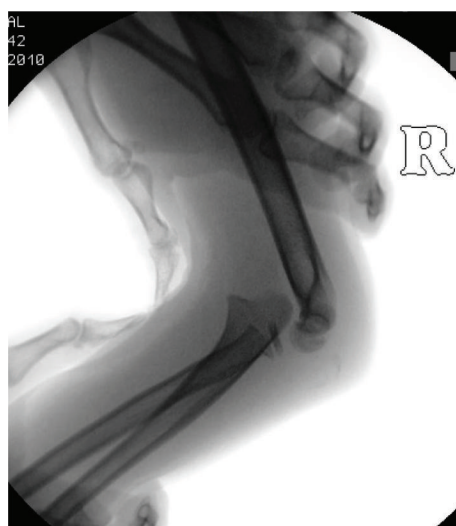
FIGURE 2: Lateral radiograph of the right elbow showing continued anterior dislocation of the ulnohumeral joint despite attempted reduction. The Salter-Harris II fracture of the radial head can again be noted.

freed from the anterior capsule, it was easily reduced into its anatomic position (Figure 3). Braided suture was used to reattach the olecranon apophysis to the proximal ulna through two drill holes in a figure of eight fashion. Final clinical exam and fluoroscopy images through a full range of motion revealed stable reduction of both the elbow joint and olecranon apophysis. The patient was splinted for approximately four weeks followed by progression of gentle passive and active elbow range of motion. At his most recent 7-month follow-up, the patient was doing very well with 0°–135° of elbow extension and flexion and 75° each of forearm pronation and supination. Radiographs revealed well aligned and healed fractures with maintained physes (Figure 4).