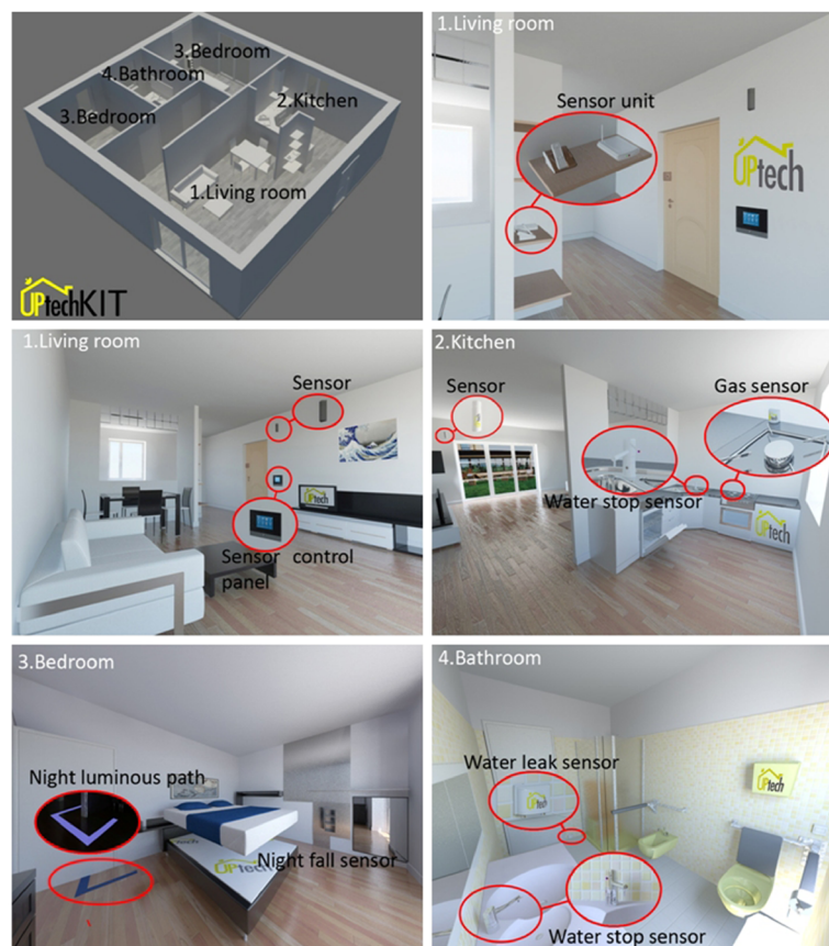
Figure 2 The design of the UP-TECH kit.

The creation of an information package for the 150 family caregivers included in the control group, illustrating the range of social and health services available in the local community, is planned. The information package will be delivered to the caregiver during home visits by the nurse. These caregivers and their families will continue to receive services in accordance with the usual care procedure, which, as already mentioned, does not include any other specific service from the health and social care systems. Some patients might receive additional care services, but