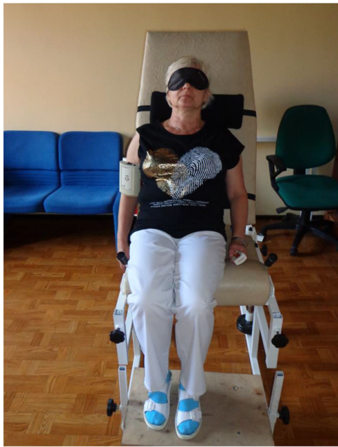
Fig. 1 Patient position during the EARJP examination of flexion. EARJP error of active reproduction of joint position

examiner (Fig. 1). The computer software allows automatic data collection. The result measured is the error of active reproduction of joint position (EARJP) [4] and calculated as absolute difference between demonstrated and reproduced angles. The average of the EARJP from 3 repetitions for each reference position was taken as the final result. JPS was measured at 14 different reference positions for each shoulder: 30°, 60°, 90°, and 120° for forward flexion and abduction and 15°, 30°, and 45° for internal (IR) and external rotation (ER) in the rTSA-operated shoulder, in the contralateral non-operated shoulder in the same group, and in both shoulders in the control group.