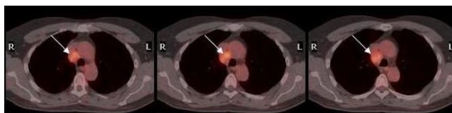
Figure 2 PET scan of thorax. ^{18}\text{F} -FDG PET scan of the thorax showing a 2.2 cm enlarged right paratracheal lymph node.